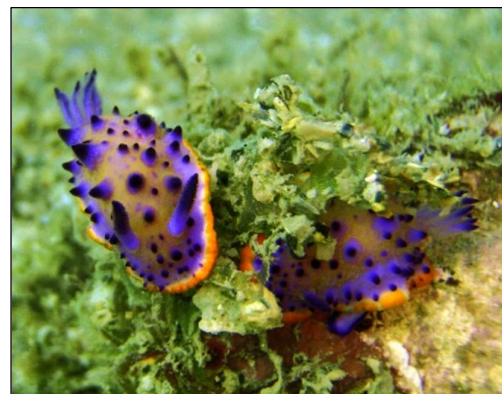
Nudibranchs at Horseshoe Bay